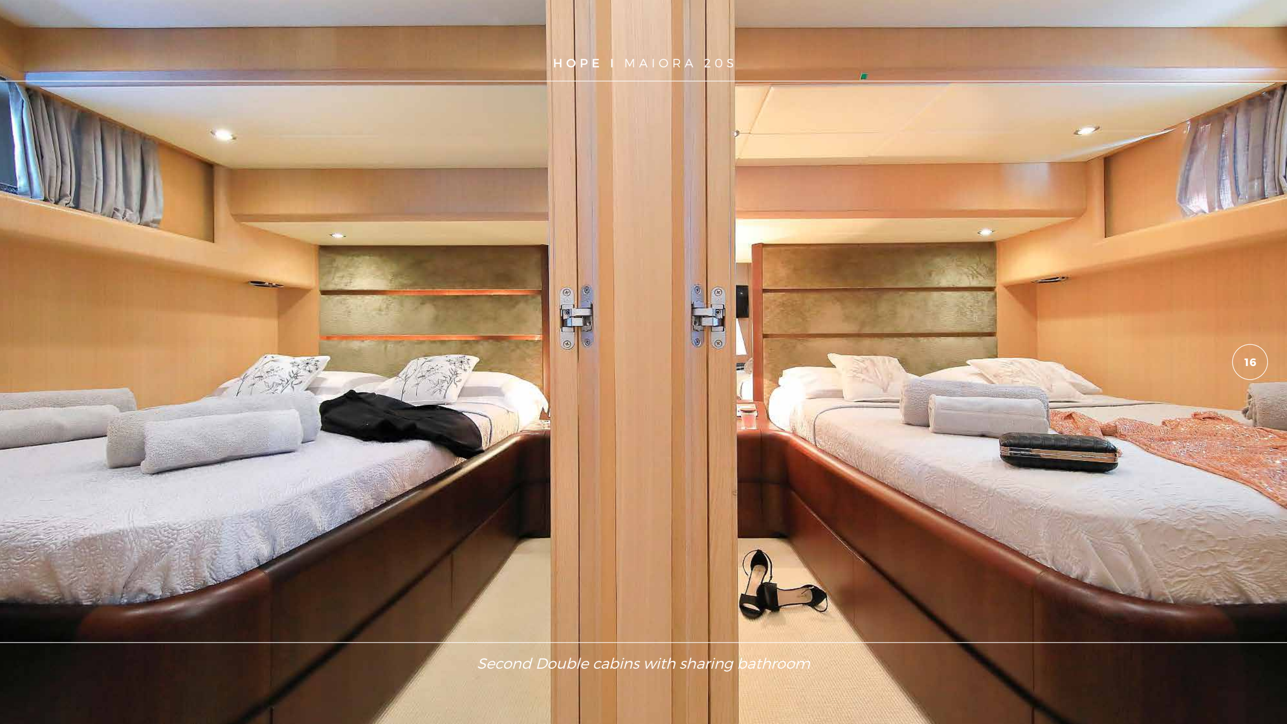
Second Double cabins with sharing bathroom