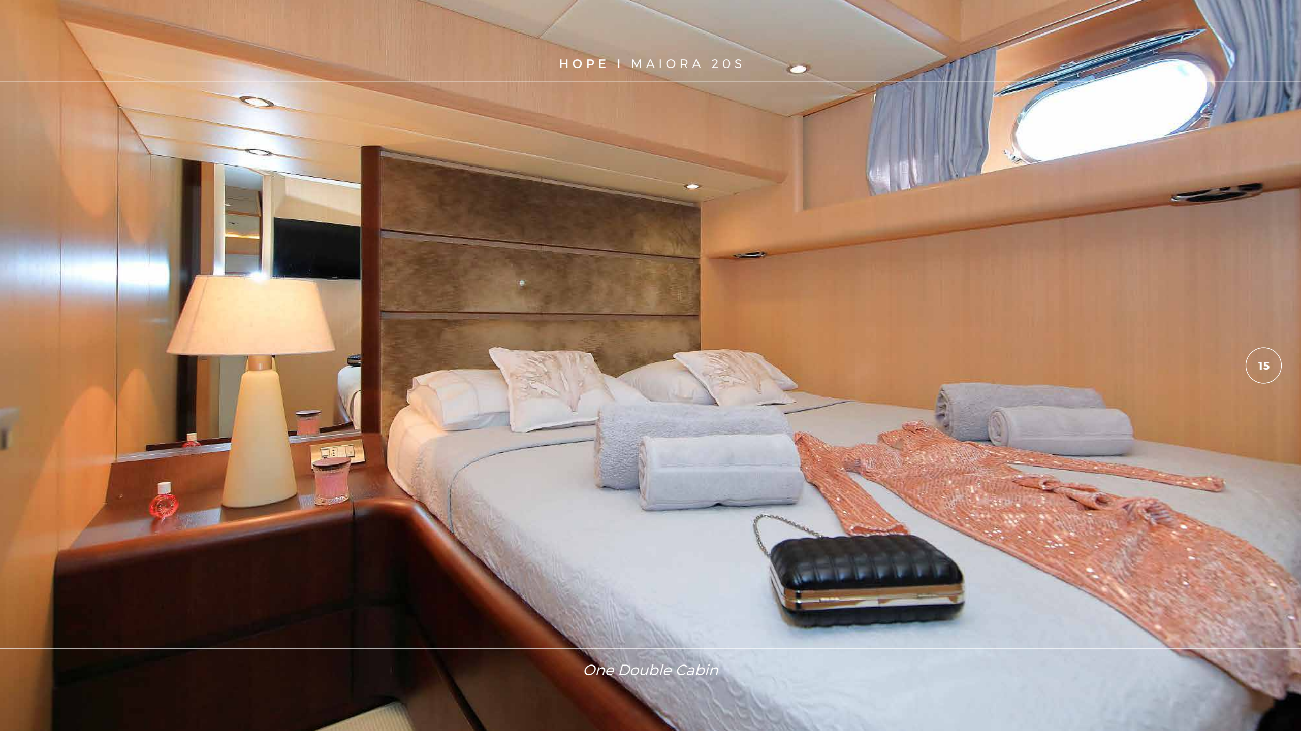
One Double Cabin